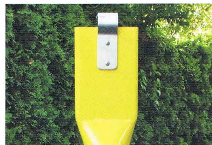
Mounting of aerial-view plates adapter