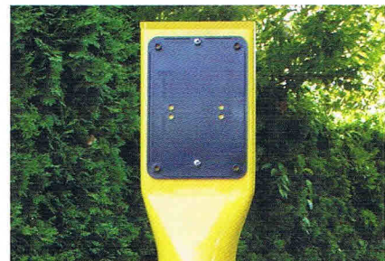
Screwed-on backing plate (can be pre-fitted at FP)