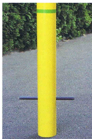
Rod-type ground anchor