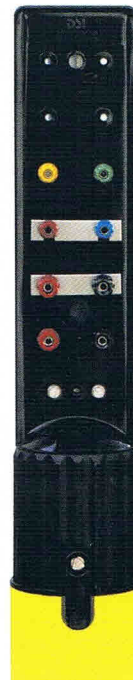
Flexible cable installation through modular system