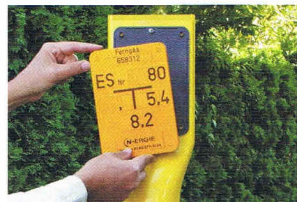
Clipping on of FP indicator sign